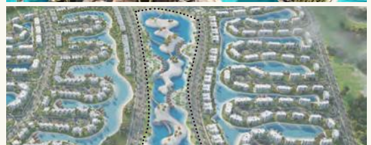
WATER PROMENADE Extends to the beach