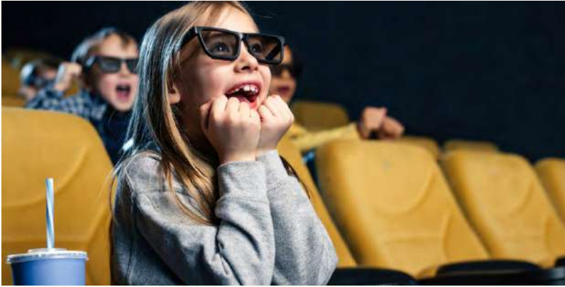
Mini Movie Theatre

Let your kids roam and explore their very own world.