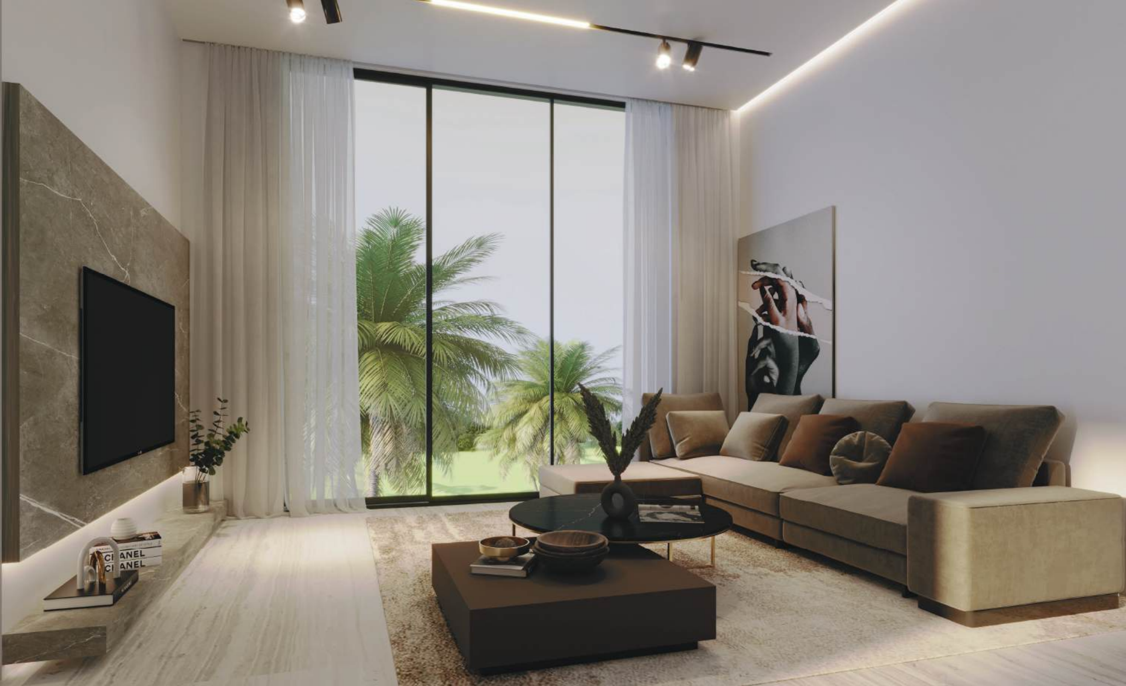
SECOND FLOOR LIVING AREA