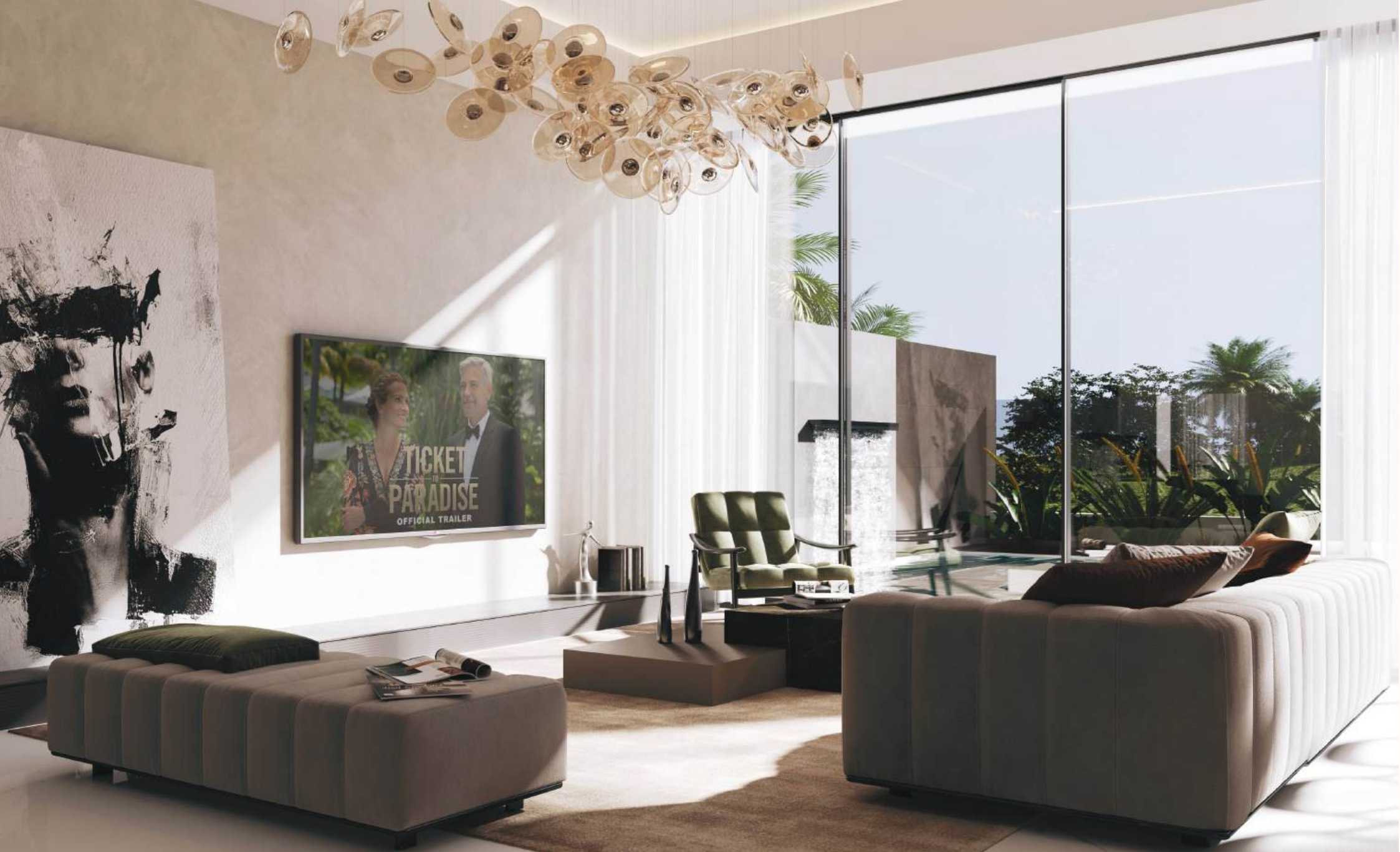
GROUND FLOOR LIVING AREA