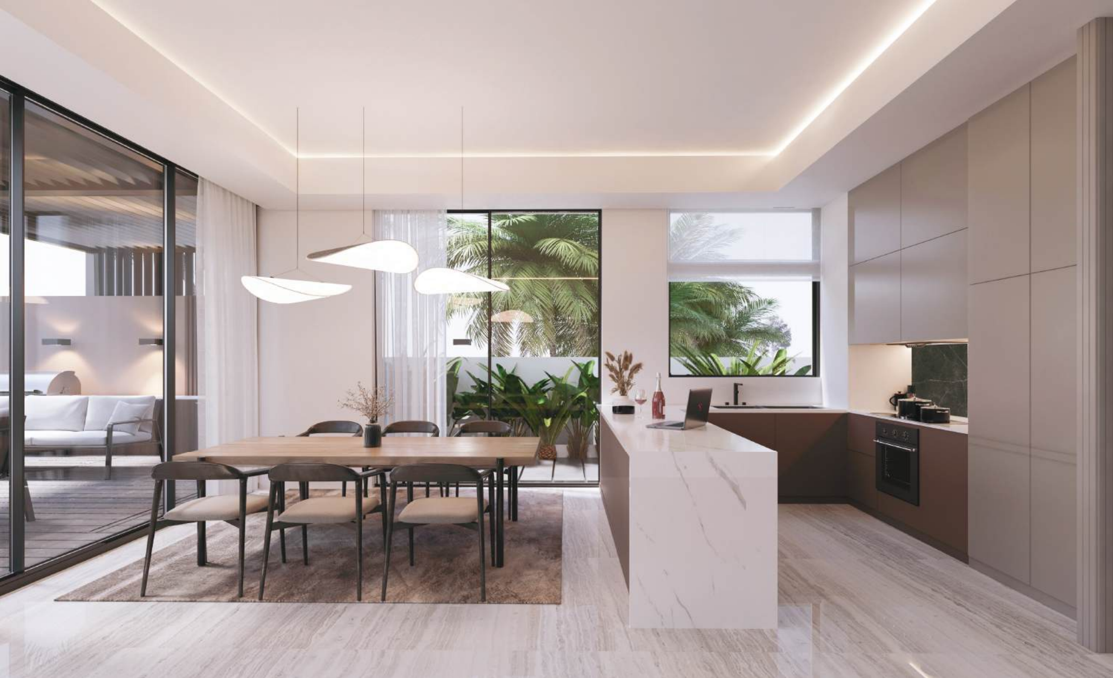
KITCHEN AND DINING