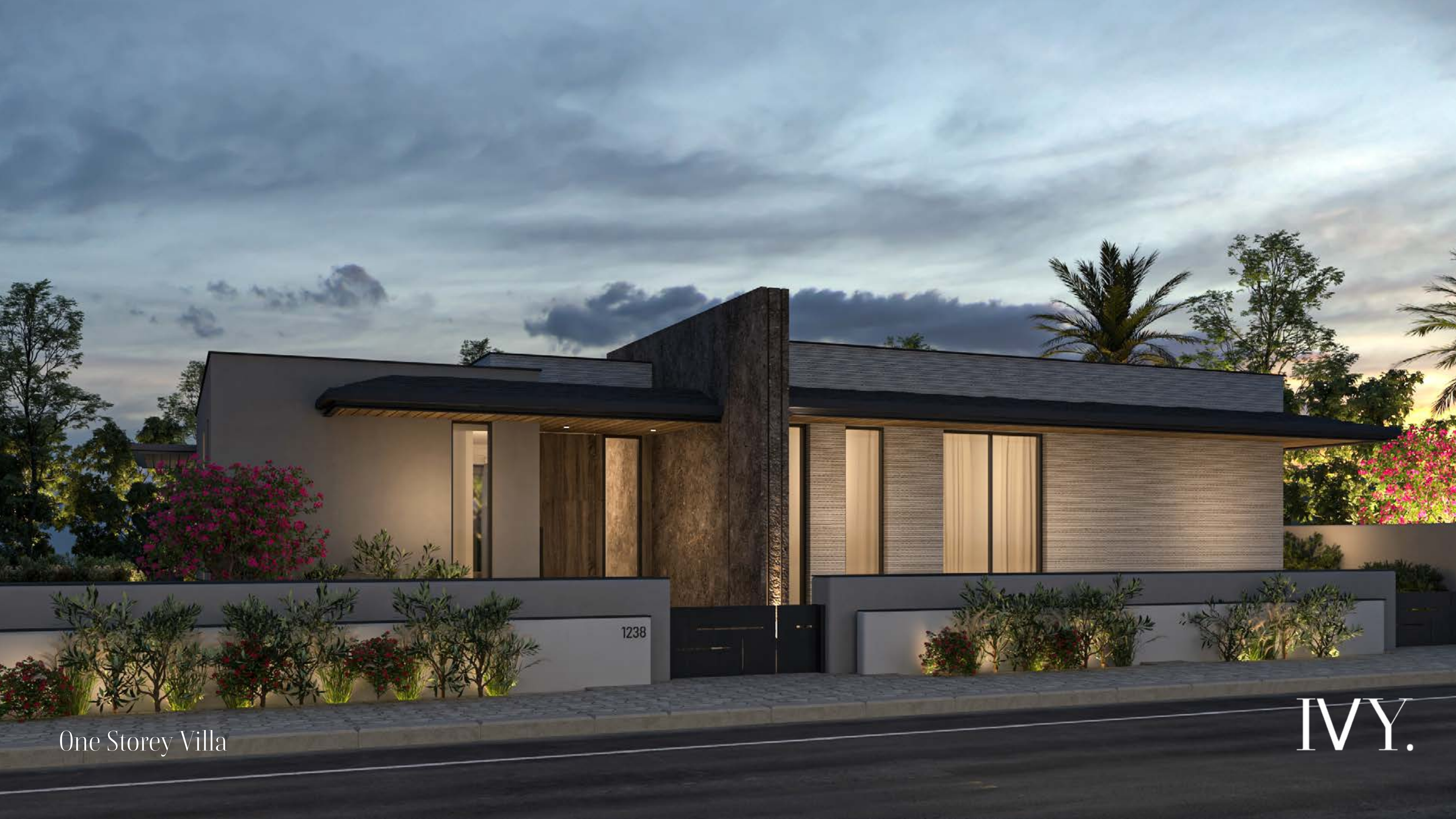
One Storey Villa