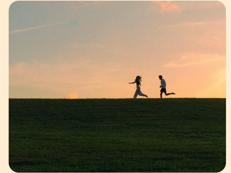
V Days of the Week