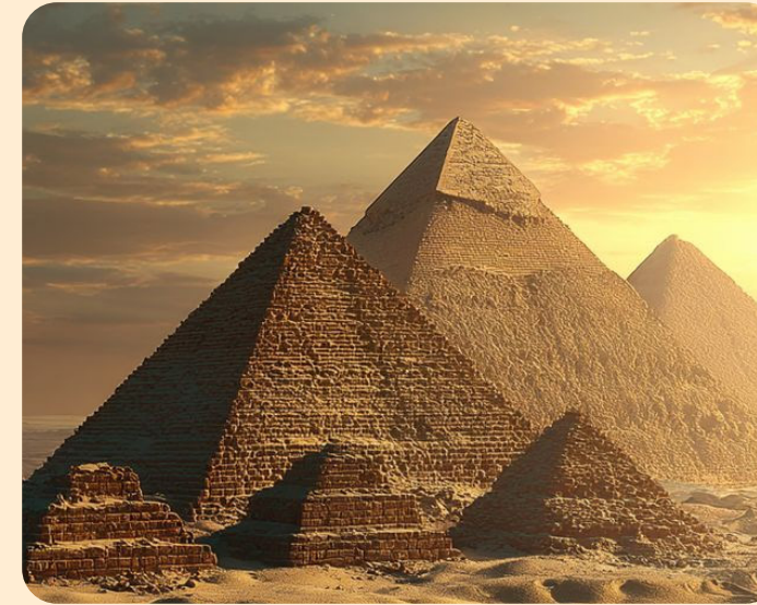
V Wonders of the World