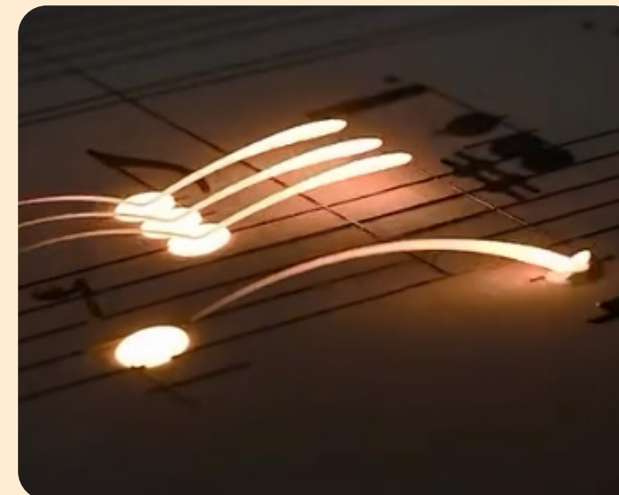
V Notes in Music