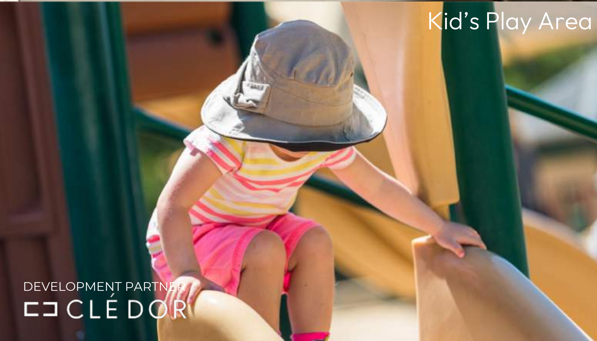
Kid's Play Area