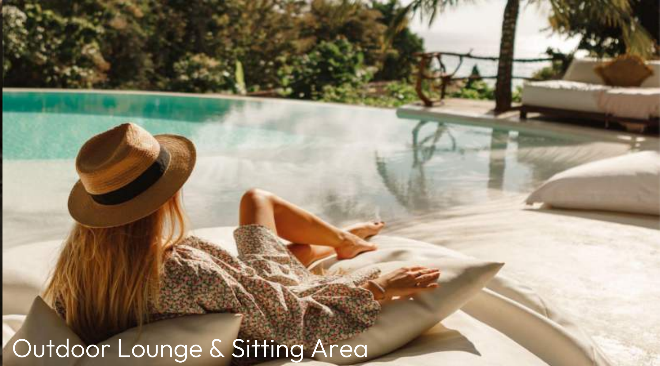
Outdoor Lounge & Sitting Area