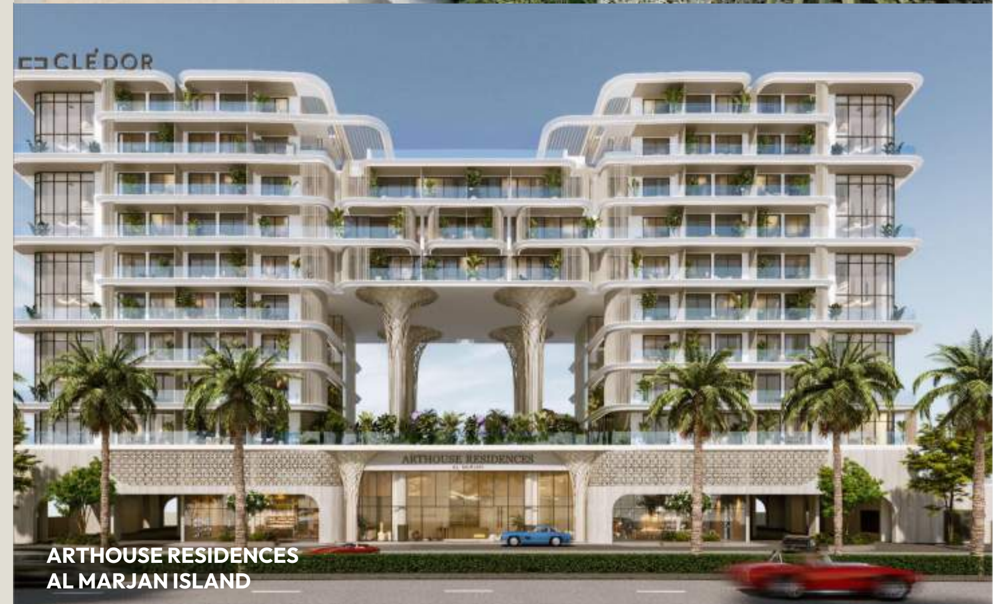
ARTHOUSE RESIDENCES AL MARJAN ISLAND