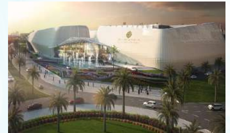
Silicon Central (Retail Centre)