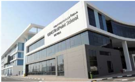
GEMS First Point School