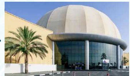
Dubai Outlet Mall