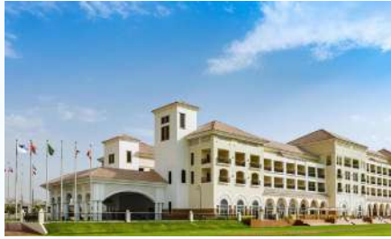
Al Habtoor Polo Resort & Club