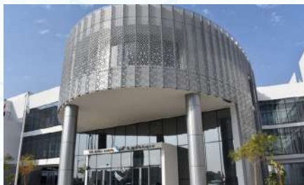
The Aquila School