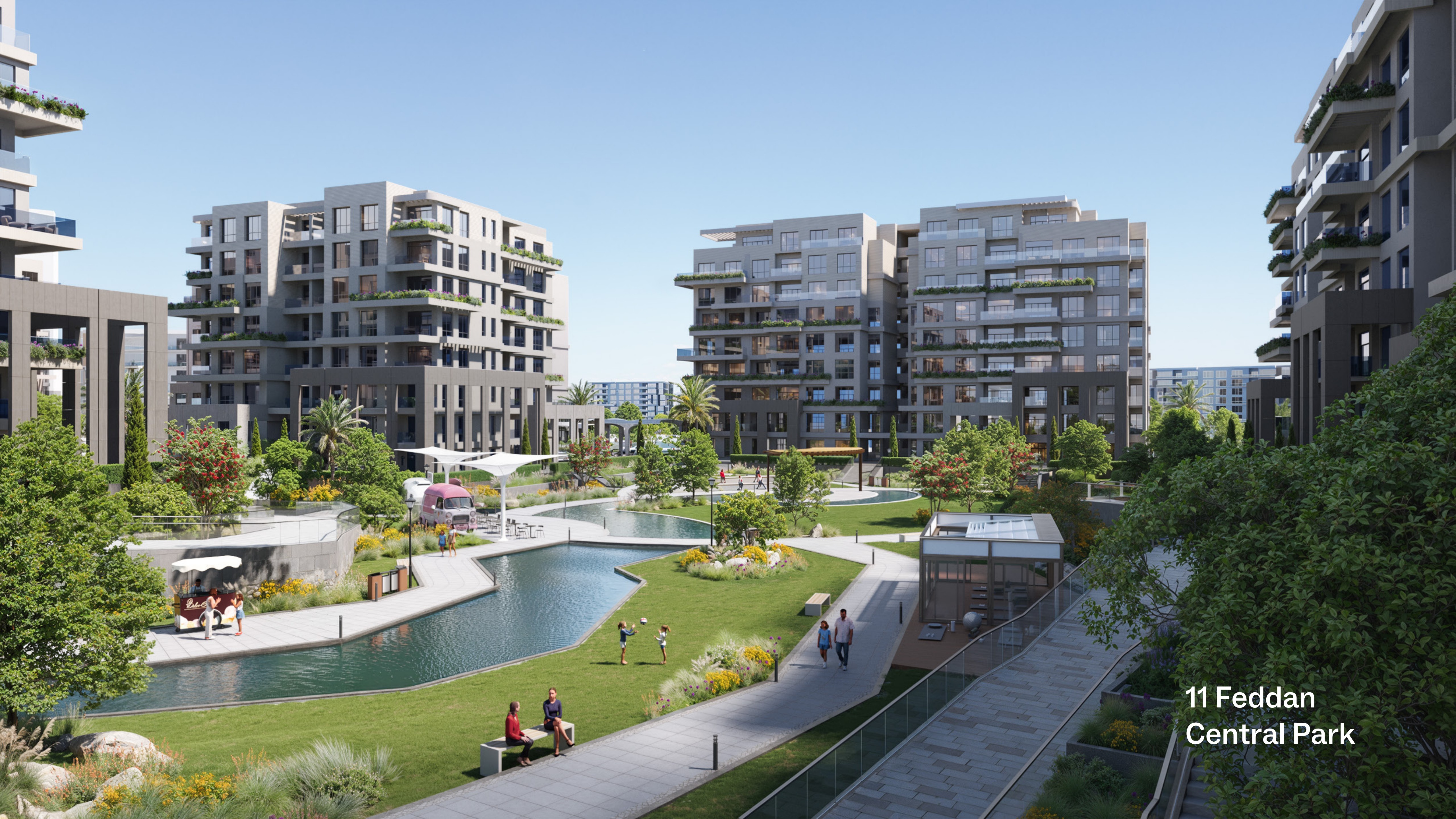
11 Feddan Central Park