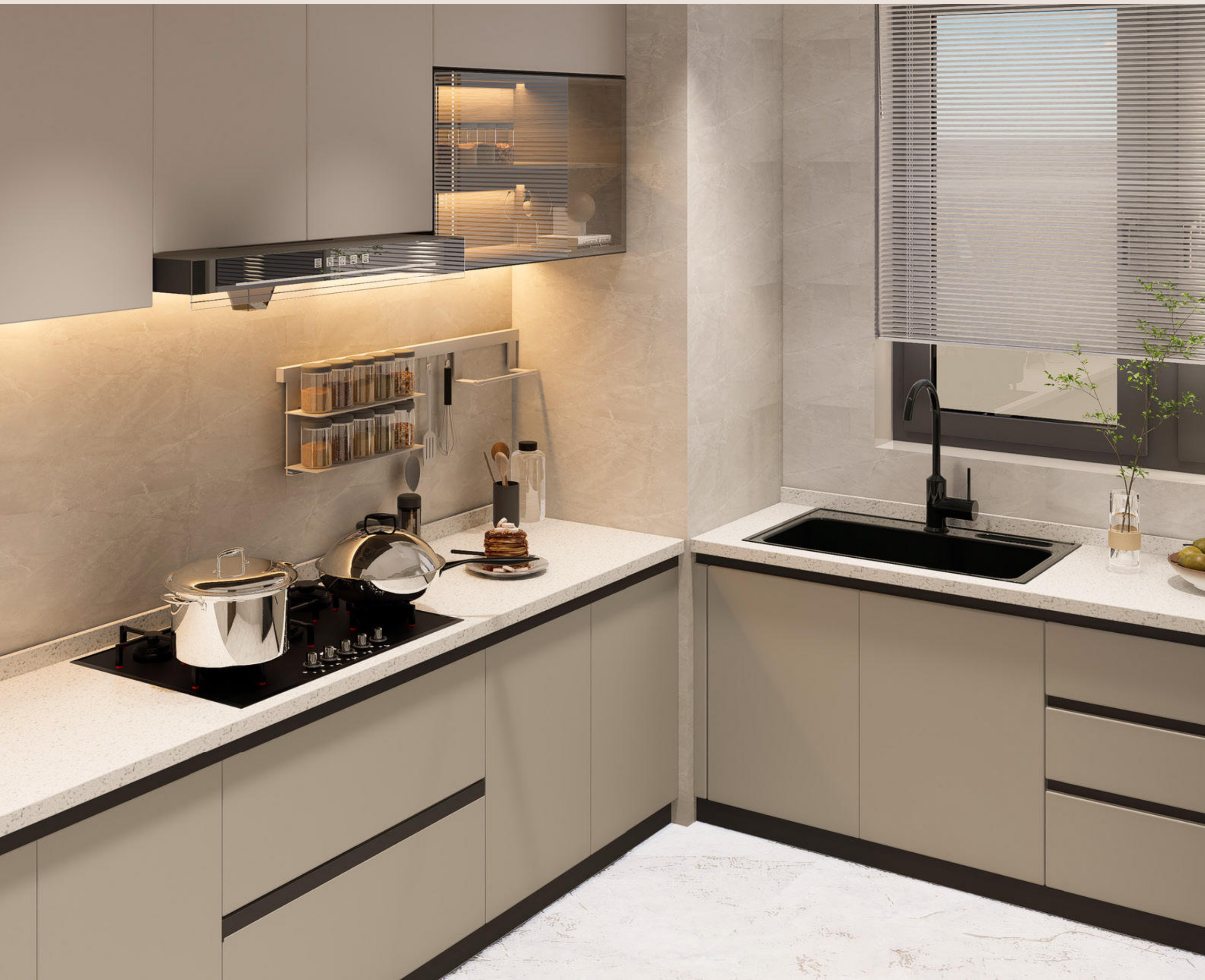
FULLY FITTED KITCHEN WITH APPLIANCES