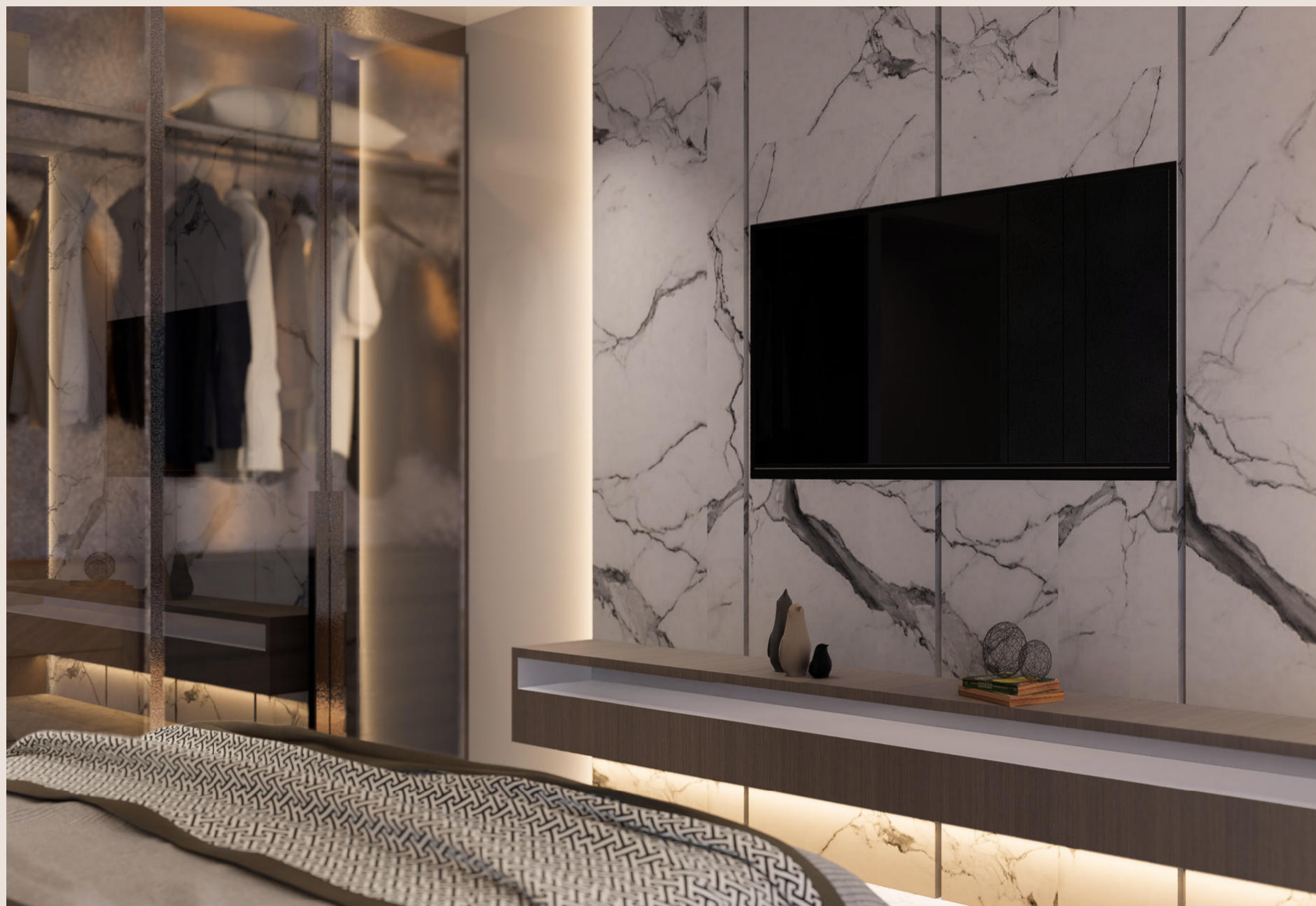
MASTER BEDROOM WITH STORAGE AND WALK-IN CLOSET