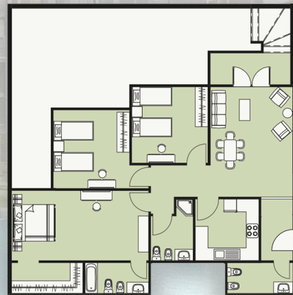
Ground F LOOR PLAN