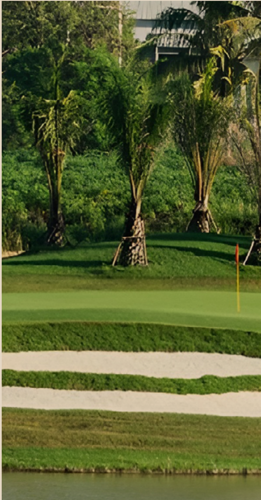
Open Green Areas