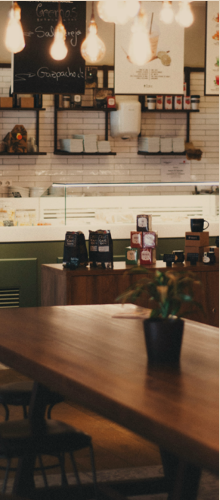
Cafes & Coffee Shops