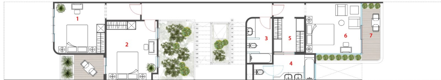
FRIST FLOOR - 105 m 2