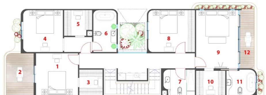
FRIST FLOOR - 145 m 2