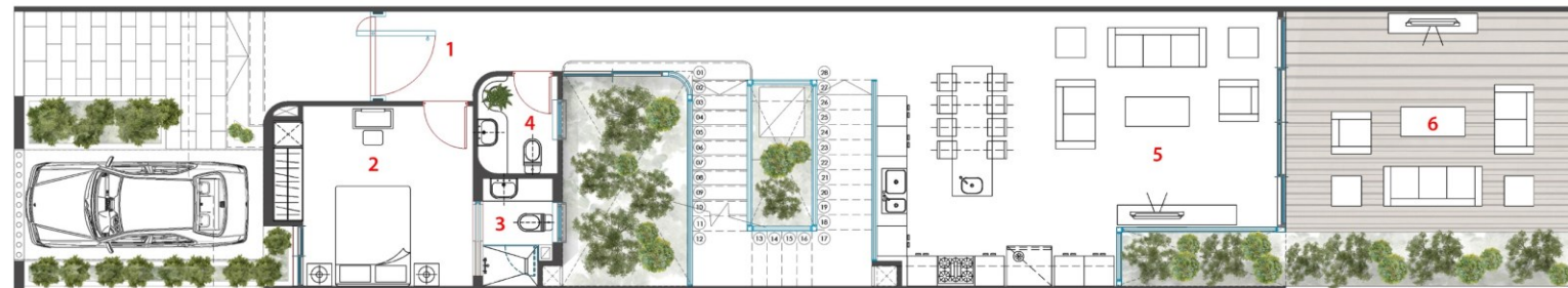
GROUND FLOOR - 95 m 2