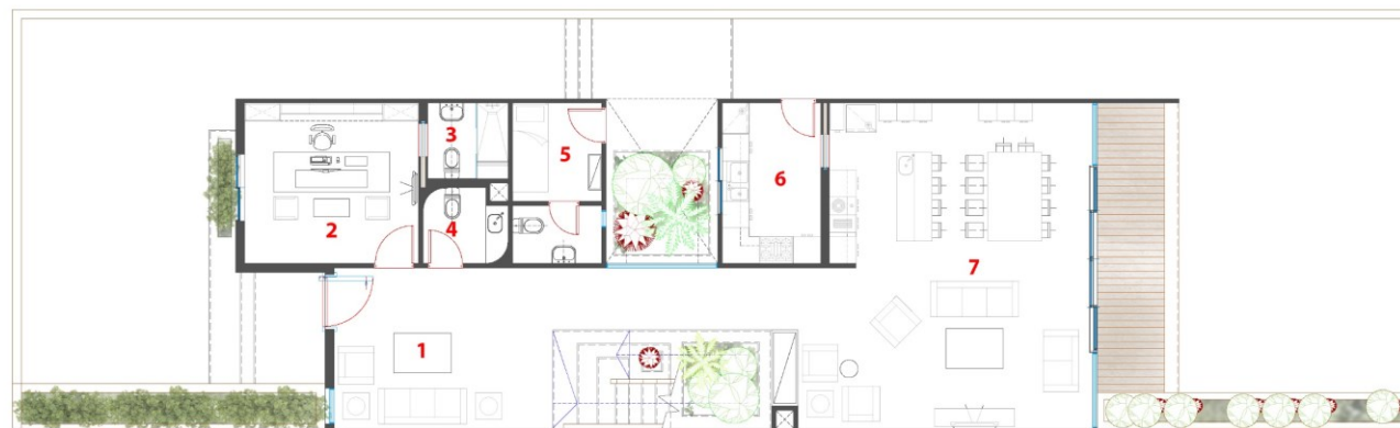
GROUND FLOOR - 130 m 2