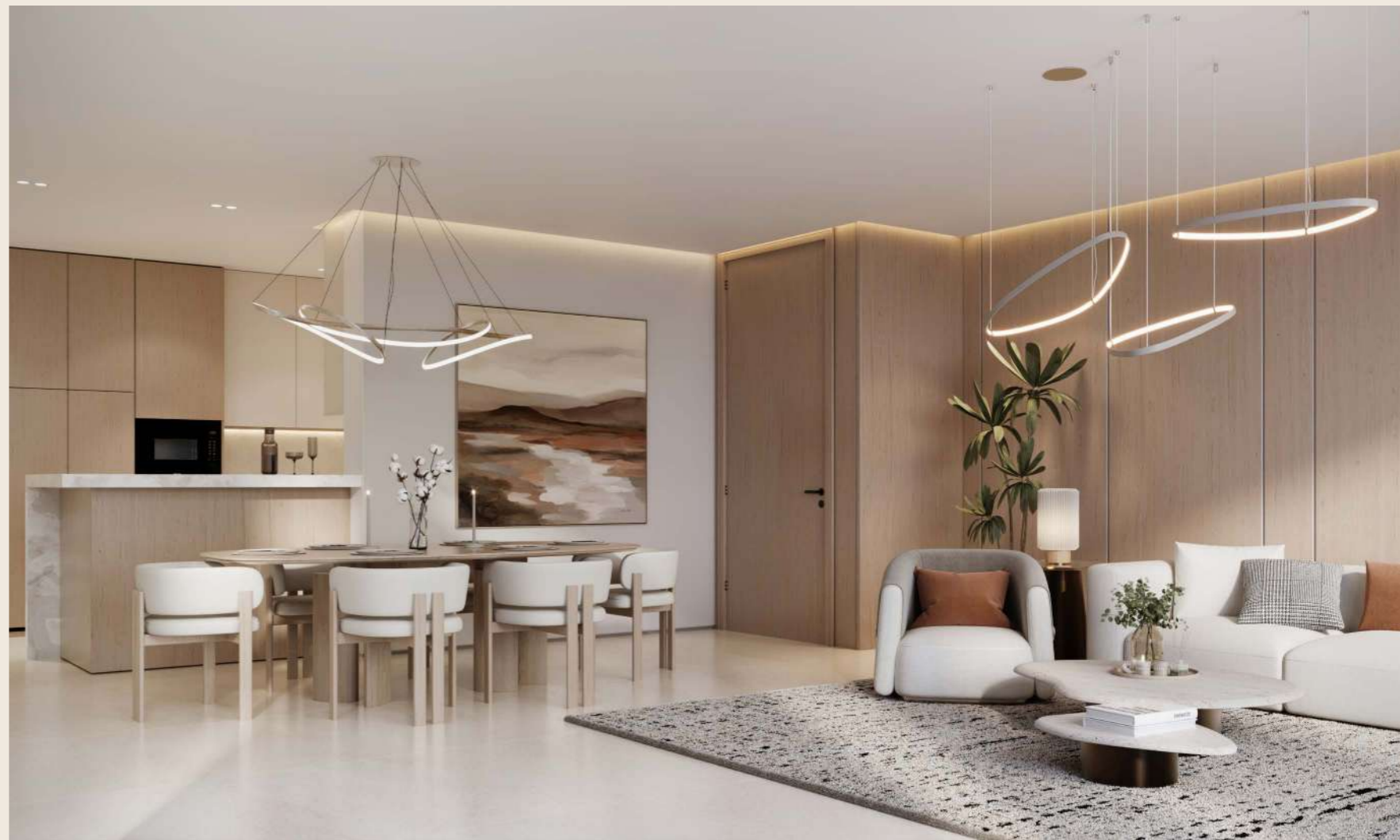
Open plan of living and dining area of a typical 3 bedroom