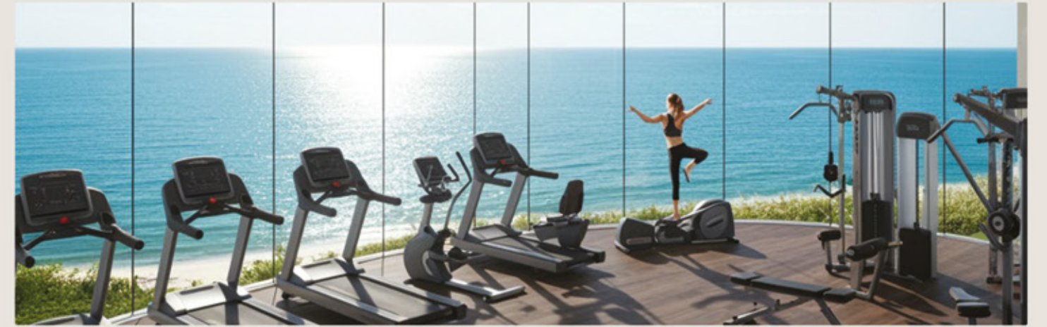
Fully Equipped Open Gym