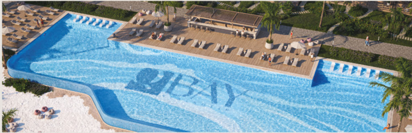
Infinity Pool m 2 1,000