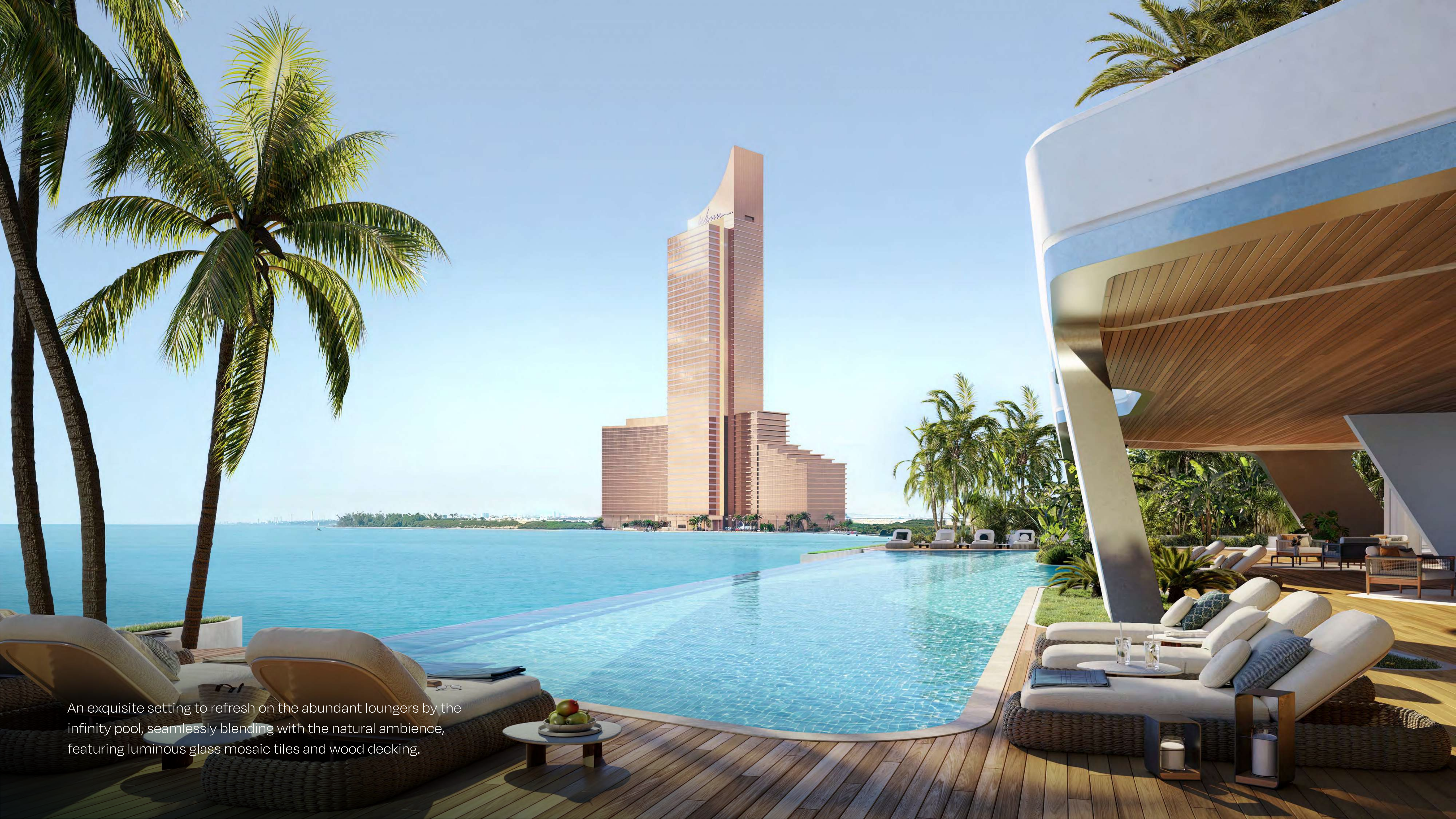
An exquisite setting to refresh on the abundant loungers by the infinity pool, seamlessly blending with the natural ambience, featuring luminous glass mosaic tiles and wood decking.